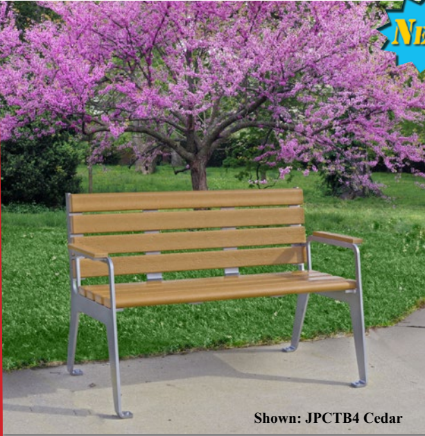
Shown: JPCTB4 Cedar