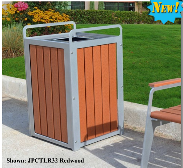
Shown: JPCTLR32 Redwood