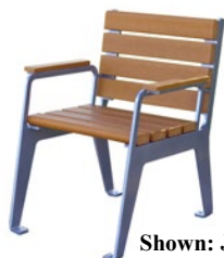
Shown: JPCTC24 Cedar