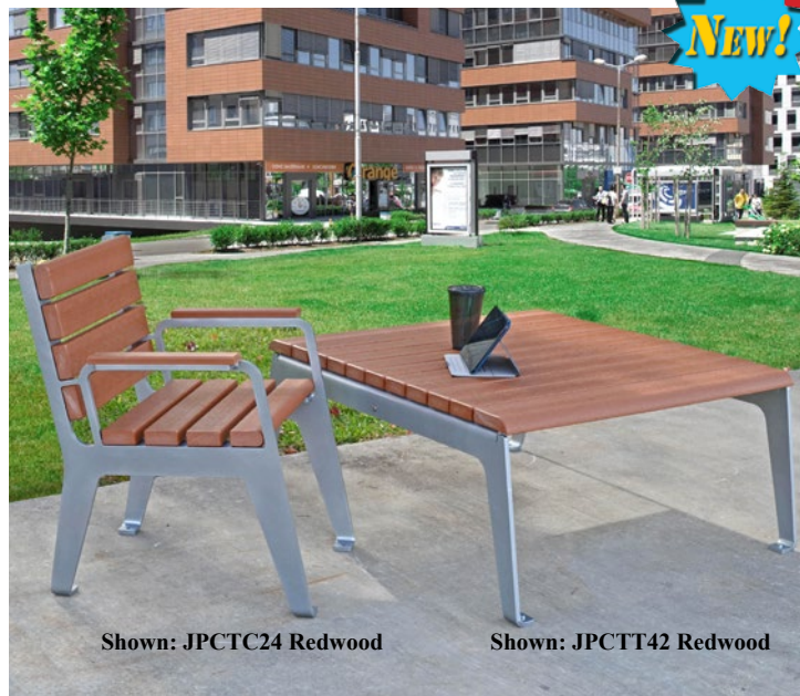
Shown: JPCTC24 Redwood