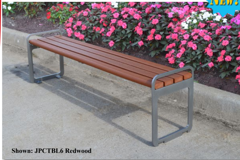
Shown: JPCTBL6 Redwood