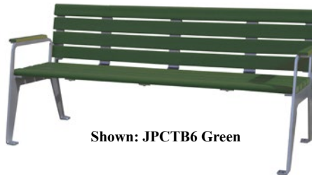
Shown: JPCTB6 Green