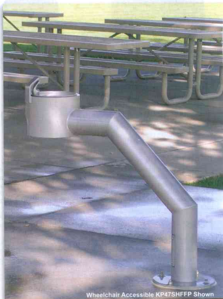
Wheelchair Accessible KP47SHFFP Shown